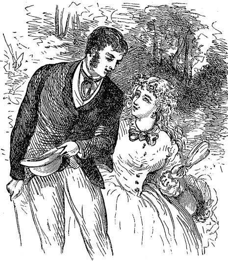
“Lillie was leaning confidentially on John’s arm.”

wonderful boldness, and at the grace of the fair entertainer.